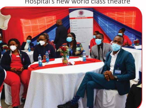
Invited guests at the launch ceremony