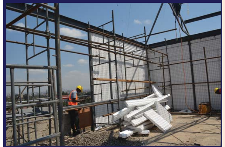
Ongoing rooftop construction