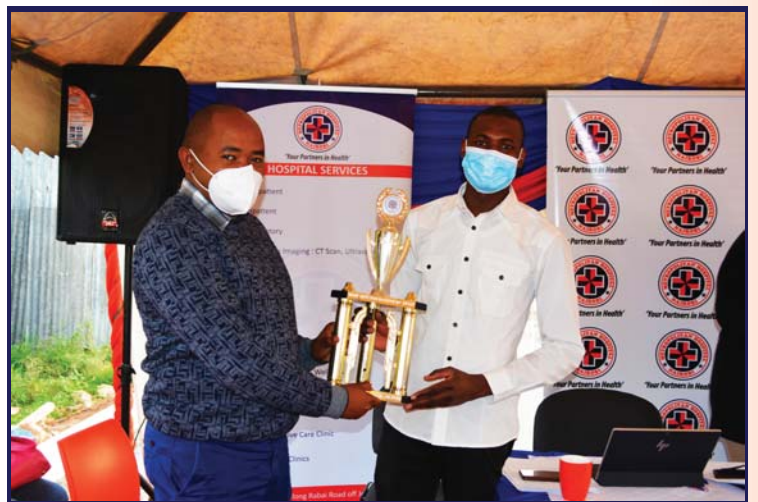
The quarterly staff forum