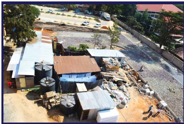
The ongoing phase II of our parking lot expansion project.