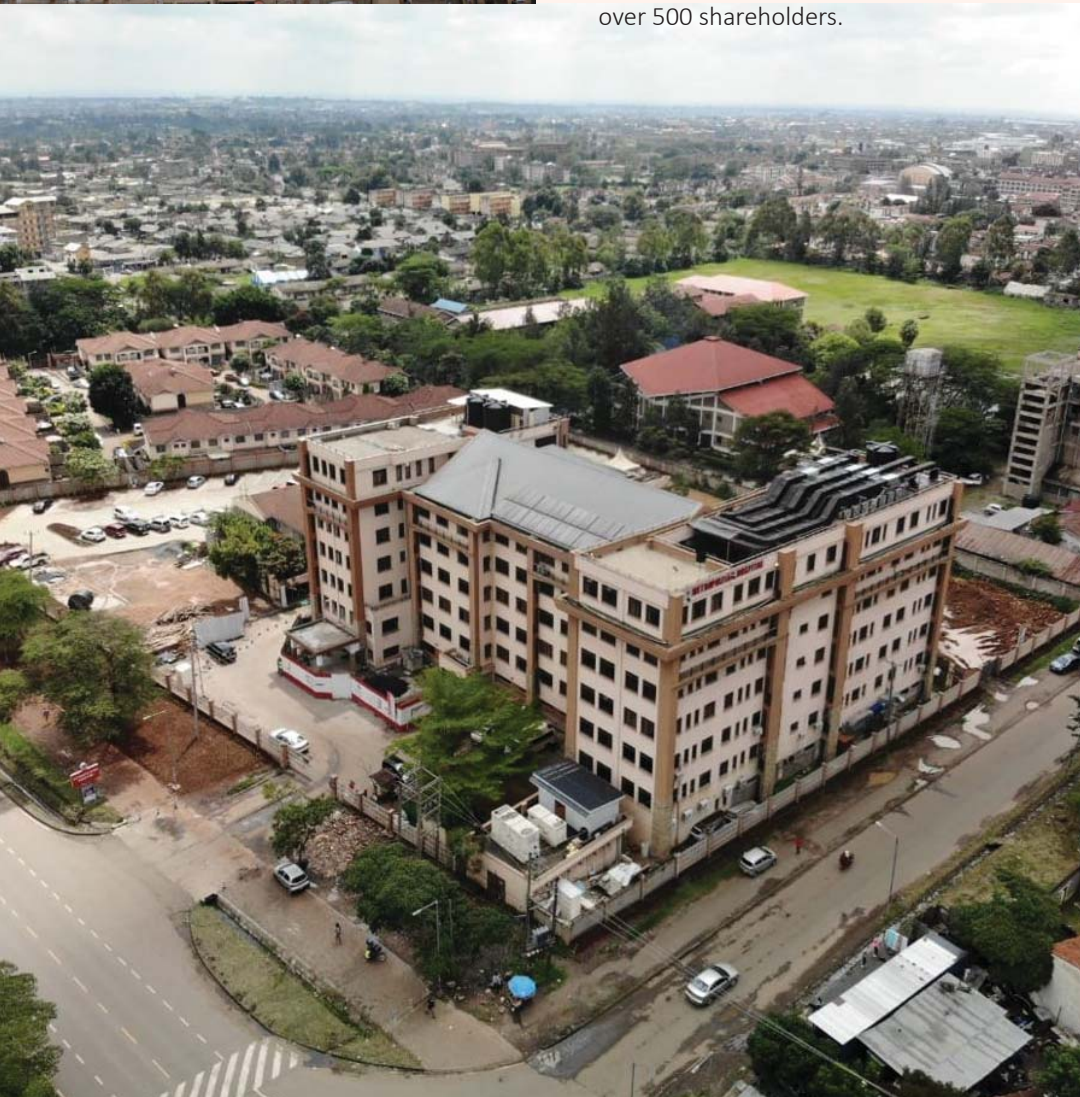
Aerial view of the hospital