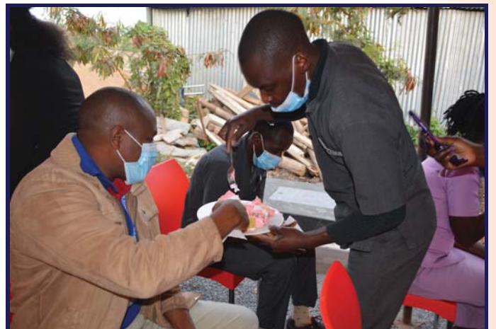
July Babies Birthday