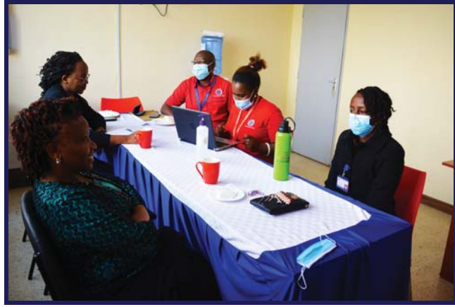
A consultative meeting between our Business Development team and a representative from Pacis Group; one of our corporate partners.