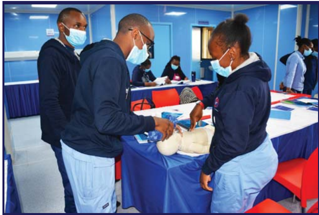
BLS and ACLS Nurses' training facilitated by Mediplus Training Limited.